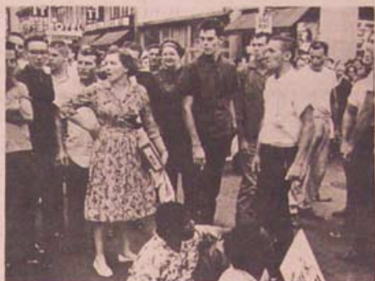
Racism, like senseless violence, is used by many people to solve their social problems.

Likewise, attempts to halt the upsurge of crime and resulting violence make sense or not depending on the political orientation and tastes of the respondent. Some, those presently in power and their supporters, choose to build rock-walled prisons to confine and deter criminals, preferring torture techniques to other alternatives. To them, it makes sense to brutalize "animals," as Black and poor prison inmates are usually called. Others strive to construct a more humane society, choosing to believe that if you reduce and eliminate the economic motive for crime, redistributing the world's vast riches and wealth in a more equitable way, the problem will be solved.