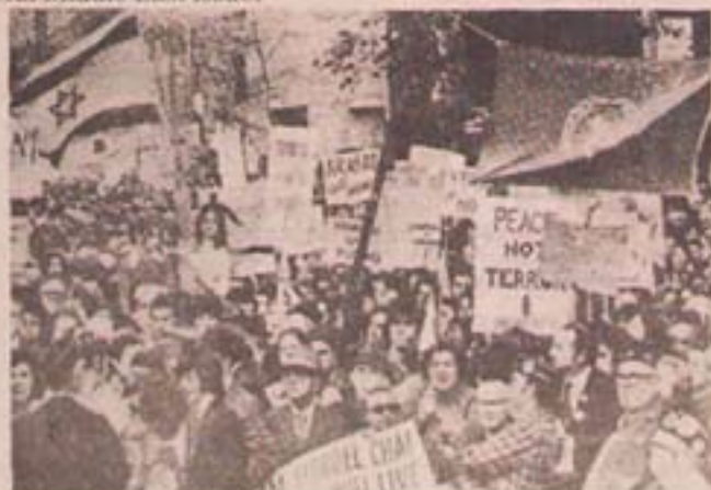
Over 100,000 people demonstrated outside the U.N. last week against the Palestinian Liberation Organization.

FOR MORE INFO LSM INFORMATION CENTER P.O. BOX 94338, Richmond, B.C., CANADA.