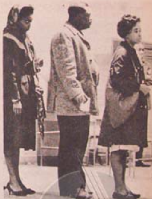
Black people have increasingly exercised their Constitutional right to vote during the last decade.

Also in January, Mervyn Dymally will become the state's first Black lieutenant-governor, moving from his post in the state Senate, where ironically, he was also the only Black representative. From the Los Angeles area, Dymally is aware of the particular problems of Black and poor communities. We welcome the victory of this astute politician to a high state post.