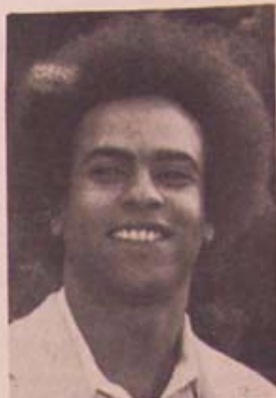
Brother HUEY P. NEWTON.

It has been stated by some people, by some parties, by some