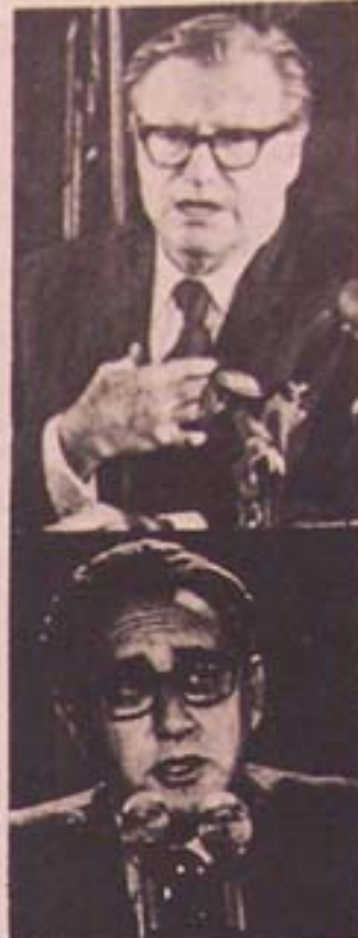
ROCKEFELLER (top) and KISSINGER.

The second-term congressman expressed great dismay in learning that the Justice Department is opposing wage increases in the case which is being pressed upon the U.S. Supreme Court. In closing, Dellums stressed his concern over the unjust situation and urged Attorney General Saxbe to refrain from any further opposition to the pay increases.