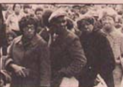
ONCE EDITED BY The Black Panther Party

Supplement to the Whole Earth Catalog The COEVOLUTION Quarterly