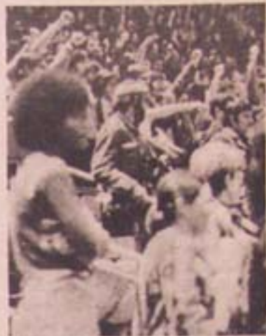
An enthusiastic crowd cheers during a mass rally for Puerto Rican independence in New York City.