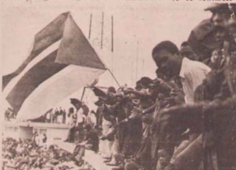
Blacks in Mozambique, celebrate signing of independence pact.

The schools must be fronts in our vigorous and conscious battle against illiteracy, ignorance and obscurantism. They must be centers for wiping out the colonial-capitalist mentality and the negative aspects of the traditional mentality: superstition, individualism, selfishness, elitism and ambition must be fought in them. There should be no place in them for social, racial or sexual discrimination. TO BE CONTINUED