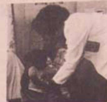
Child and family health care is an important part of the Clinic's community Out-Reach programs.

Voucher booklets provide food from the milk and dairy products group, the meat group, the vegetable and fruit group, and the bread and cereal group. These foods are selected to provide specific nutrients most often lacking in sufficient quantities in the diets of pregnant and