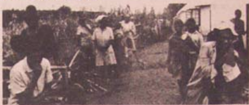
African workers and families in Natal, South Africa, slave for starvation-level wages.

Noting the explosive situation that such a foreign policy decision would create in the U.S. and abroad if it became public