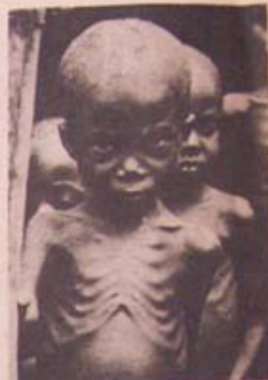
The greed of Western powers has caused many children in the world to be hungry.

The World Food Conference is demonstrating that if the world's peoples leave the problem of starvation up to the U.S., countless more will go hungry. □