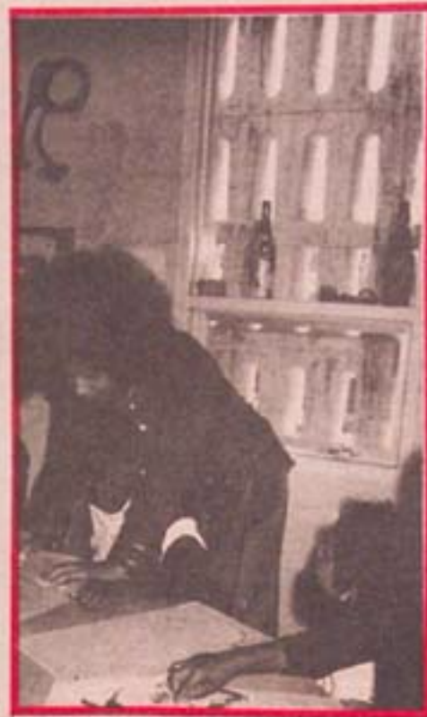
Children at the Intercommunal Youth Institute escape the problems of Oakland's public schools.

As the Children's Center program is presently constituted, the overwhelming majority of the paraprofessional personnel are Black or other non-White people.