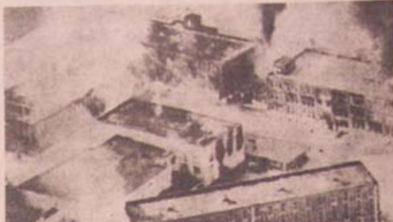
McAlester Prison in flames as a result of 1973 inmate rebellion.