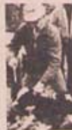
Cows Slaughtered See Page 6.