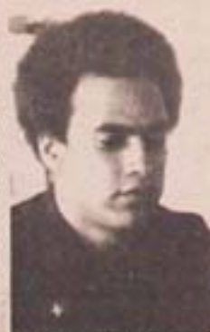
HUEY P. NEWTON