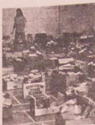
The White Panther Party operates a food cooperative.

feelings in eastern North Carolina, where Beaufort County is located. Her lawyers' first motion to have the trial moved to another county was denied because North Carolina law only permits transfer to an adjoining county in eastern North Carolina, which would have the same racial attitudes as Beaufort County. The lawyers are planning to appeal this denial and to test the Constitutionality of the state law.