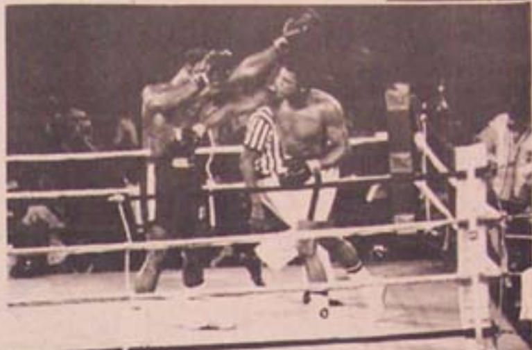
Coming off the ropes as FOREMAN (left) became more flat-footed, ALI punctuated each round with fast, stinging shots like this right-hand lead.

"I don't want to be a house-boy," he told newsmen at one point. "I make $1 million from Magnavox, and I don't need any more public relations." □