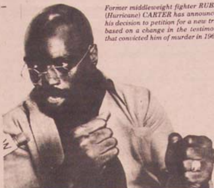
Former middleweight fighter RUBIN (Hurricane) CARTER has announced his decision to petition for a new trial based on a change in the testimony that convicted him of murder in 1967.

Brother Carter charged that he was framed by police and prosecution officials because of his militant stand on civil rights in Paterson, New Jersey, site of serious Black rebellion in 1966.