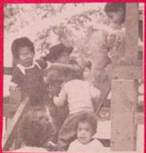
The children of the Head Start Center, which is looking for the monthly representative from the Oakland Board of Education, are looking for the monthly representative from the Oakland Board of Education.

The Head Start Center, which is looking for the monthly representative from the Oakland Board of Education, is looking for the monthly representative from the Oakland Board of Education. She has been in the community for 10 years, and she has been in the community for 10 years.